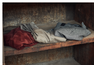
MOTIF 31 pants 1 1228 PLEAT