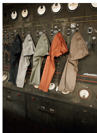
MOTIF 33 pants 1 1202 LOU