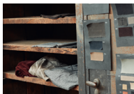
MOTIF 30 pants 1 1228 PLEAT