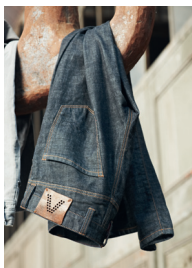
MOTIF 34 1896 LUCA