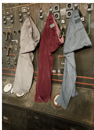
MOTIF 32 pants 1 1202 LOU