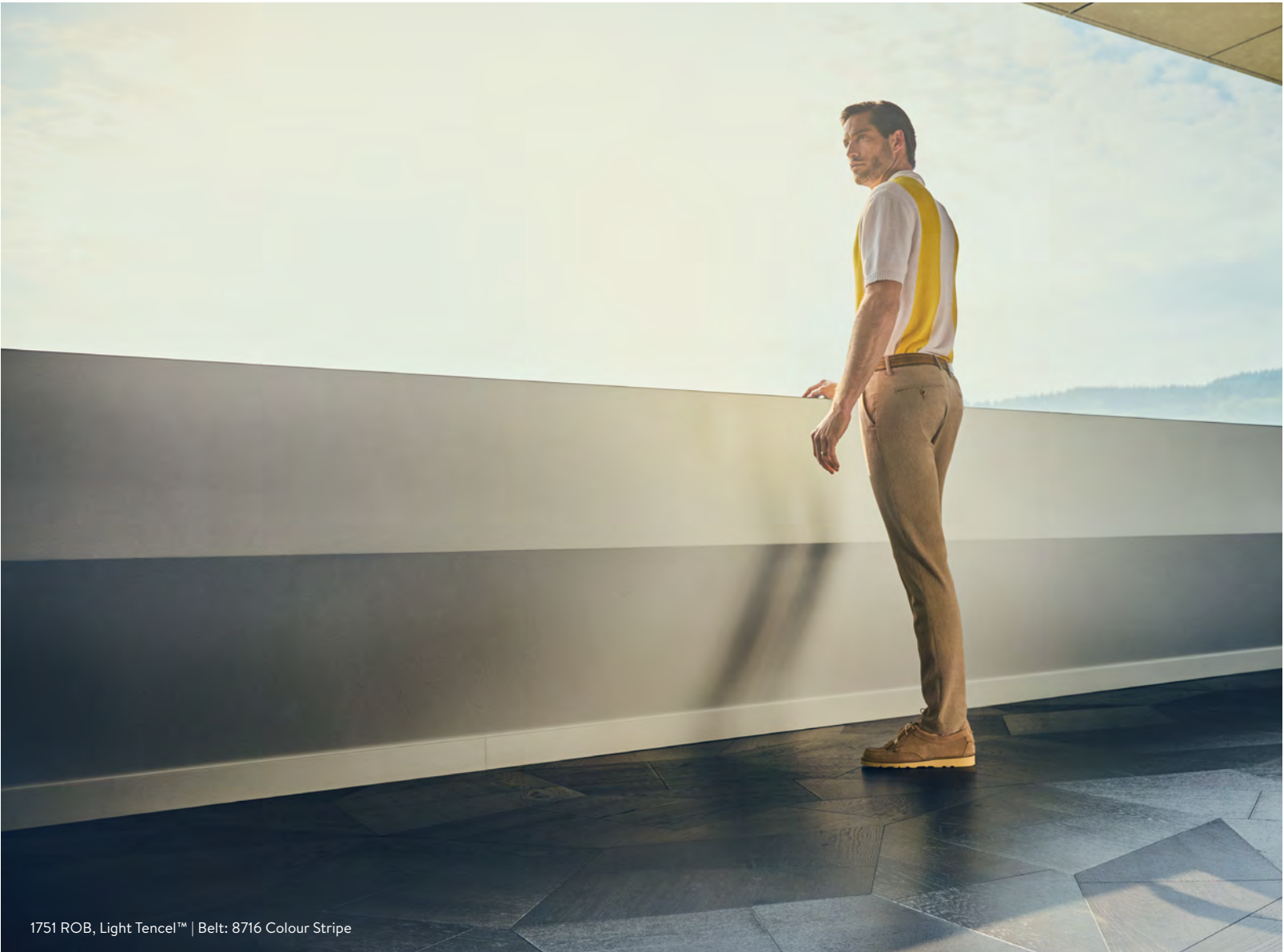
1751 ROB, Light Tencel™ | Belt: 8716 Colour Stripe