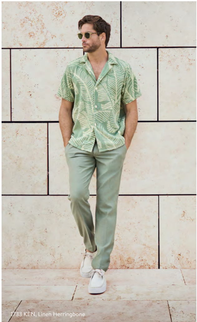
1733 KEN, Linen Herringbone