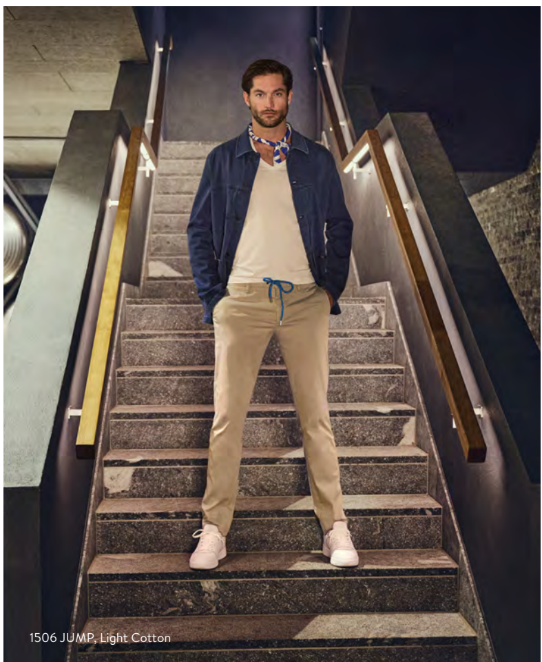
1506 JUMP, Light Cotton

This credo has inspired our organic range for the next summer season as well. The result: distinctive looks and durable materials made from recycled spandex fibres and organic cotton with the Oeko-Tex Standard 100 seal, still stylish years after the first time they're worn. For us, sustainability is more than just quality, it's also about reducing the use of water through modern, environmentally friendly finishing processes. That's what we've done with the 'Taylor' and 'Mike-C' chinos, are made of ultra-light Super Stretch Cotton with an elasticity level of 35 percent and available in a total of nine colourways. The same goes for the 'Rob-K' shorts and last but not least for our pants in elastic 11 oz made by Candiani denims, available as 'Slim' and 'Robin'.