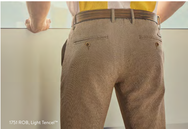
1751 ROB, Light Tencel™