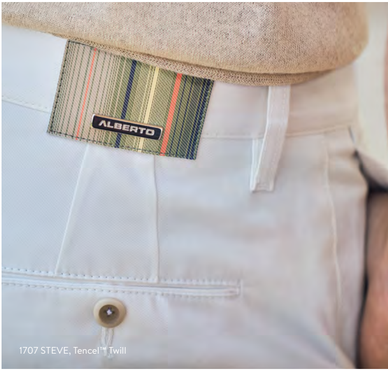
1707 STEVE, Tencel™ Twill