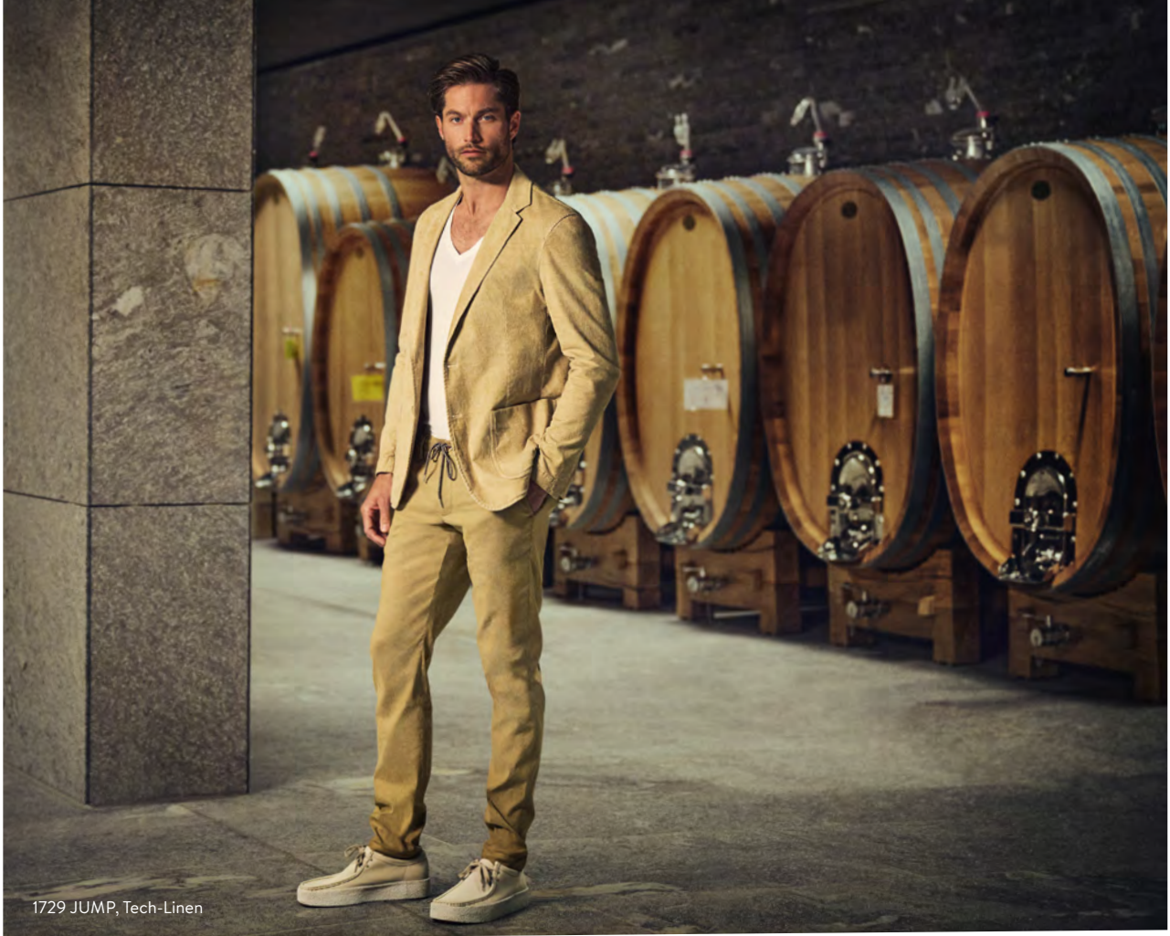
1729 JUMP, Tech-Linen