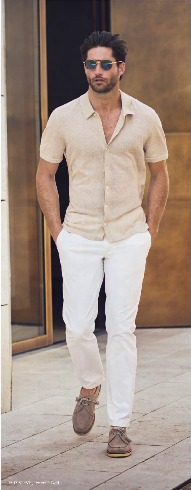
1707 STEVE, Tencel™ Twill

They're particularly soft and hard-wearing, ensure pleasantly cool wearing comfort in summer temperatures. They also make a strong showing in terms of sustainability - pants made of Tencel™ are real all-rounders that know just how to appeal on so many levels. For summer 2023, we're showcasing an extra-wide range of styles, colours and patterns to demonstrate all the different ways in which certified bio-based cellulose fibres made from the renewable raw material wood can be used. Simple and smart: the Superlight Tencel™ as 'Rob' chino, the Minicheck Tencel™ with micro checks, also available as 'Rob', and the finely striped Tencel™ Stripe , available both as 'Rob' and as the brand new tapered-fit chino 'Steve'. Light and casual: the Tencel™ Glencheck and Light Tencel™ , presented as 'Rob' and as the quasi-chino 'Jump' with drawstrings.