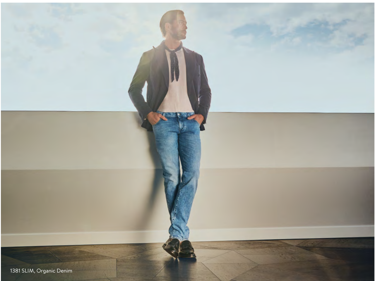
1381 SLIM, Organic Denim