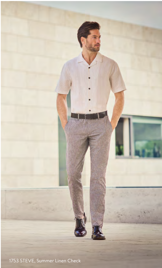
1753 STEVE, Summer Linen Check

The hype around linen pants continues unabated. There's a good reason for this, after all, pants made from the robust natural fibres offer unbeatably light and casual comfort as well as naturally cooling properties. For the 2023 summer season, we're showcasing the potential of linen in all its facets here. The Pure Linen range comes with garment-dye over-dyed 100 percent linen-only fabrics as 'House' in a long and a shorts variant, both in an extra-wide colour range that extends from Off-White, Natural and Light Military through Smokey Grey and Navy to Light Violet, Ash, Light Mint and Apricot. Linen Herringbone plays with the classic Herringbone pattern in a wide variety of variations. In addition to the 'Rob', 'Lou-J', 'House' and the 'Jump' with drawstring , we're also focusing on the pleated pants 'Ken' and the slim-fit cargo 'Wind'. Here, too, the colour spectrum is particularly wide with Off-White, Ash, Navy, Nature, Military, Apricot, Sky, Fresh Carrot and Deep Grey. The ultimate highlight: pants made from innovative Japanese Tech Linen . The plain and crease-resistant pants with the cool feel, which are available as 'Jump', 'Rob' and as Cargo 'Wind' in Black, Dark Navy, Military, Dark Grey, Nature, Corn and Off-White, create a 32 percent degree of elasticity thanks to a sophisticated mix of materials. Record-breaking!