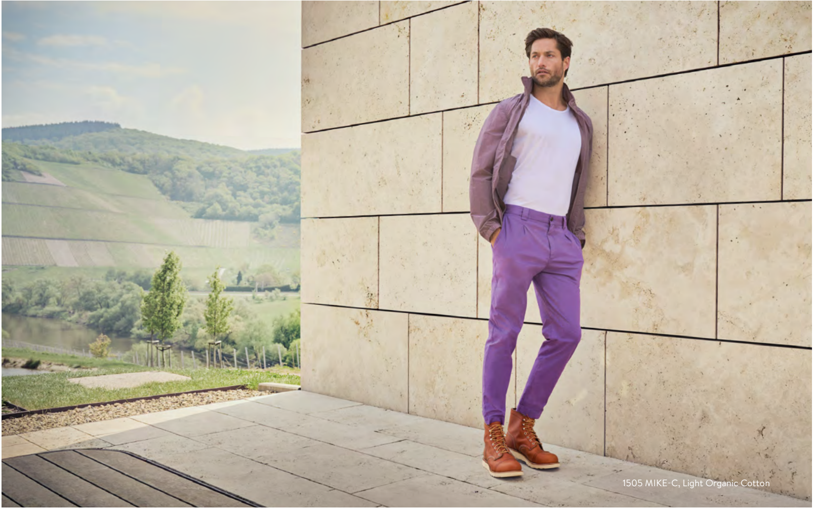
1505 MIKE-C, Light Organic Cotton