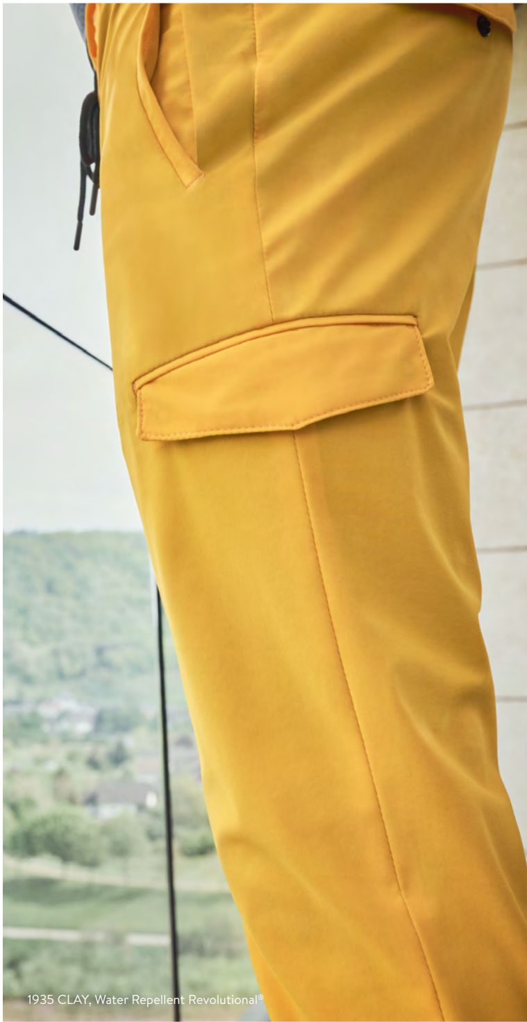
1935 CLAY, Water Repellent Revolutionary®