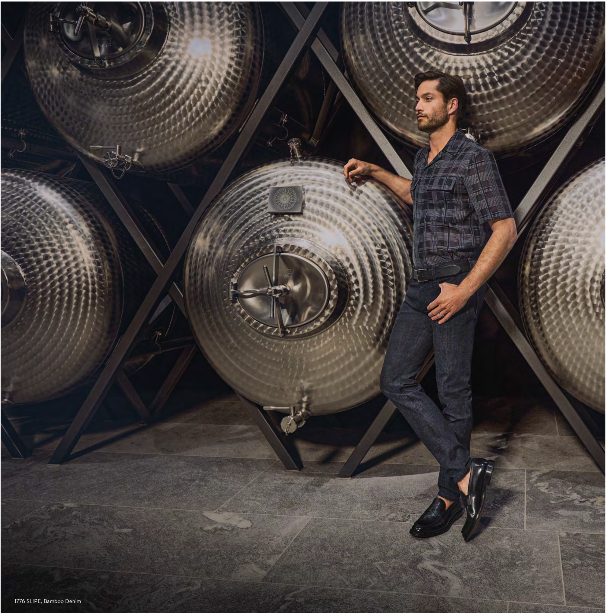
1776 SLIPE, Bamboo Denim

We believe in only keeping what's good and paving the way for sustainable innovations. Accordingly, we set out to find environmentally conscious alternatives to classic denim made from cotton grown in a water-intensive process - and after extensive research, we finally found them in denim made from a robust cotton/bamboo fibre mix. The ecological advantages are clear: bamboo grows extremely quickly even without the use of pesticides, is extremely hard-wearing and needs virtually no water. In addition, our exclusive Bamboo Denims fit perfectly as usual, with sophisticated details and a multitude of functions. They protect against UV radiation, are thermoregulating, antibacterial and wick moisture. For the official Summer 2023 launch, the smart pants are available in one black and one blue variant each.