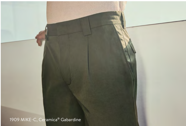
1909 MIKE-C, Ceramica® Gabardine