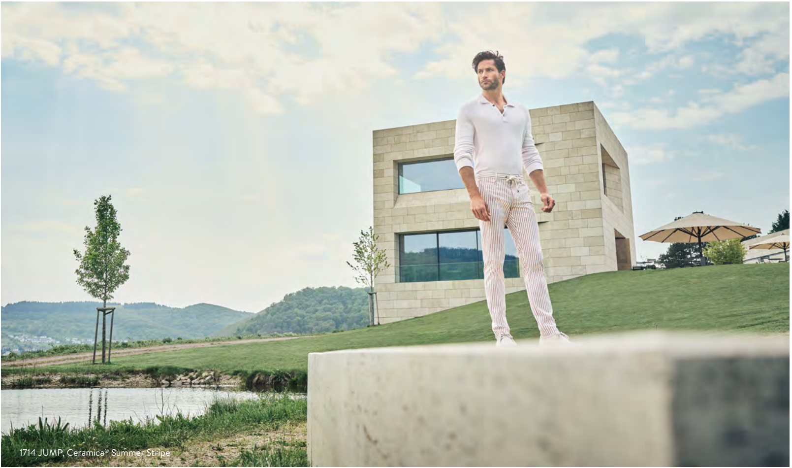
1714 JUMP, Ceramica® Summer Stripe