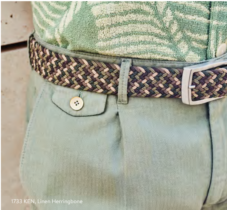
1733 KEN, Linen Herringbone