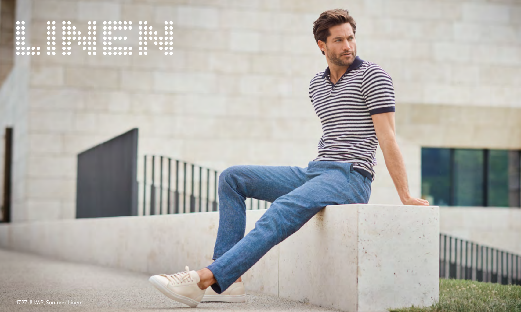
1727 JUMP, Summer Linen