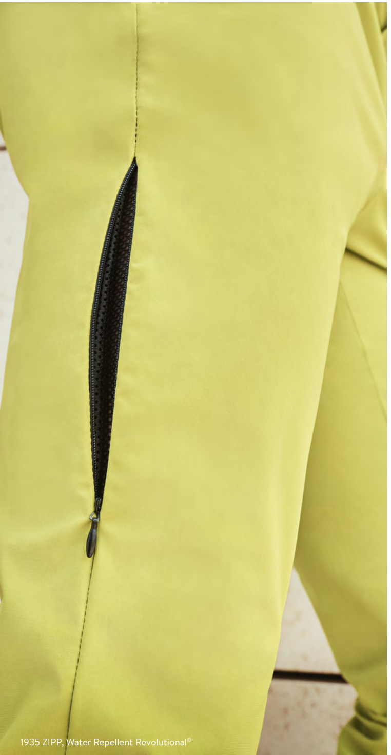
1935 ZIPP, Water Repellent Revolutionary®