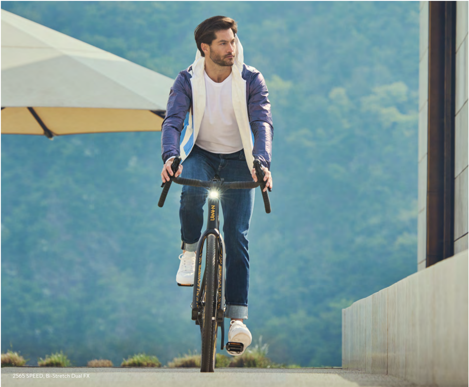
2565 SPEED, Bi-Stretch Dual FX