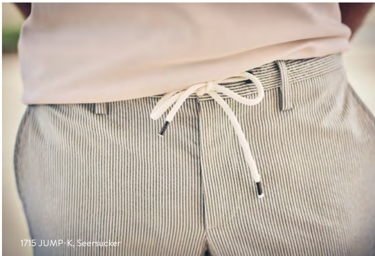
1715 JUMP-K, Seersucker