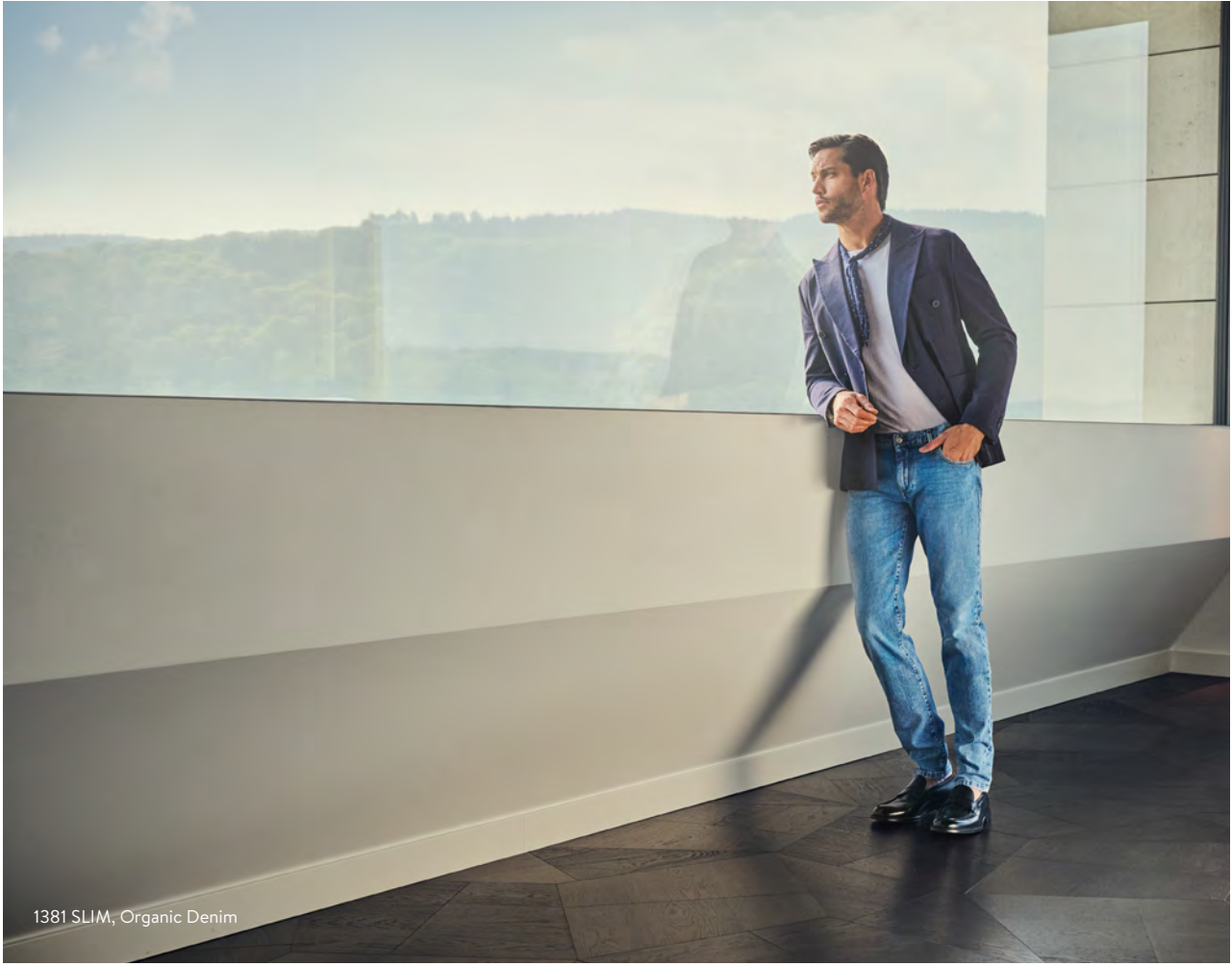
1381 SLIM, Organic Denim