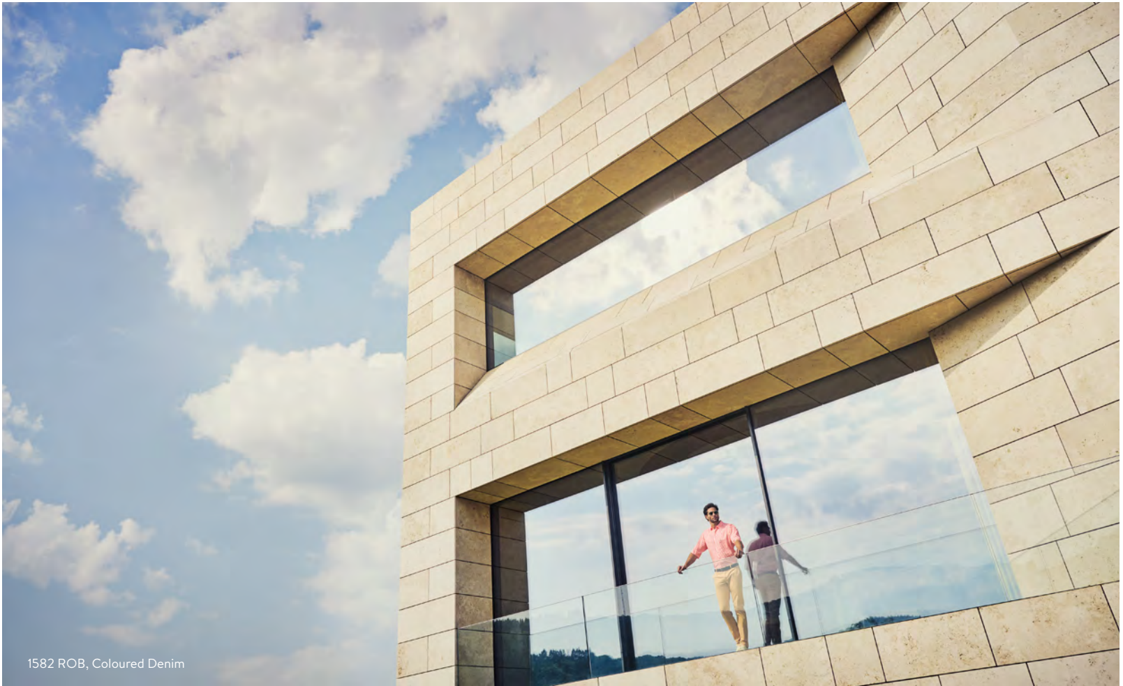
1582 ROB, Coloured Denim