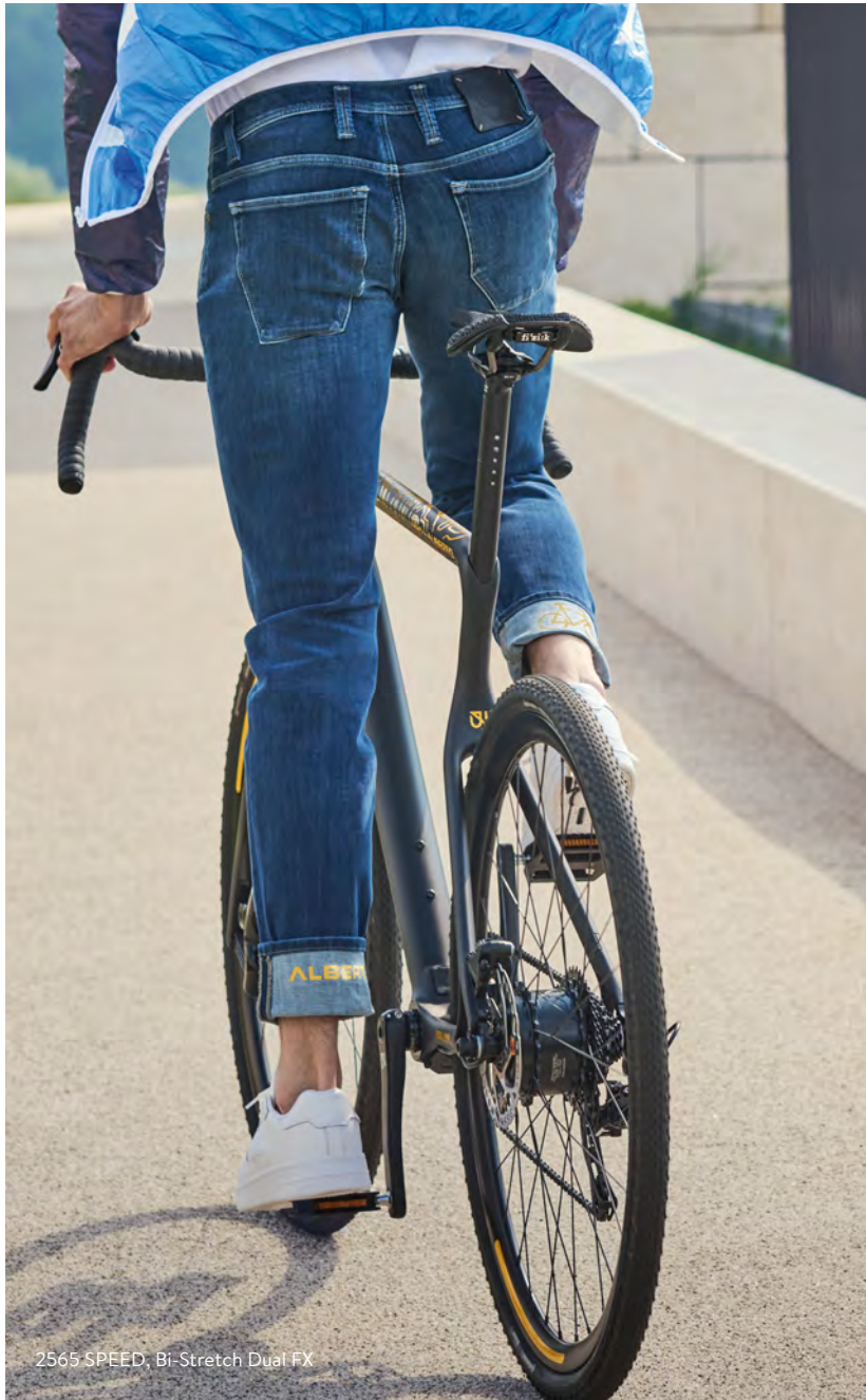
2565 SPEED, Bi-Stretch Dual FX