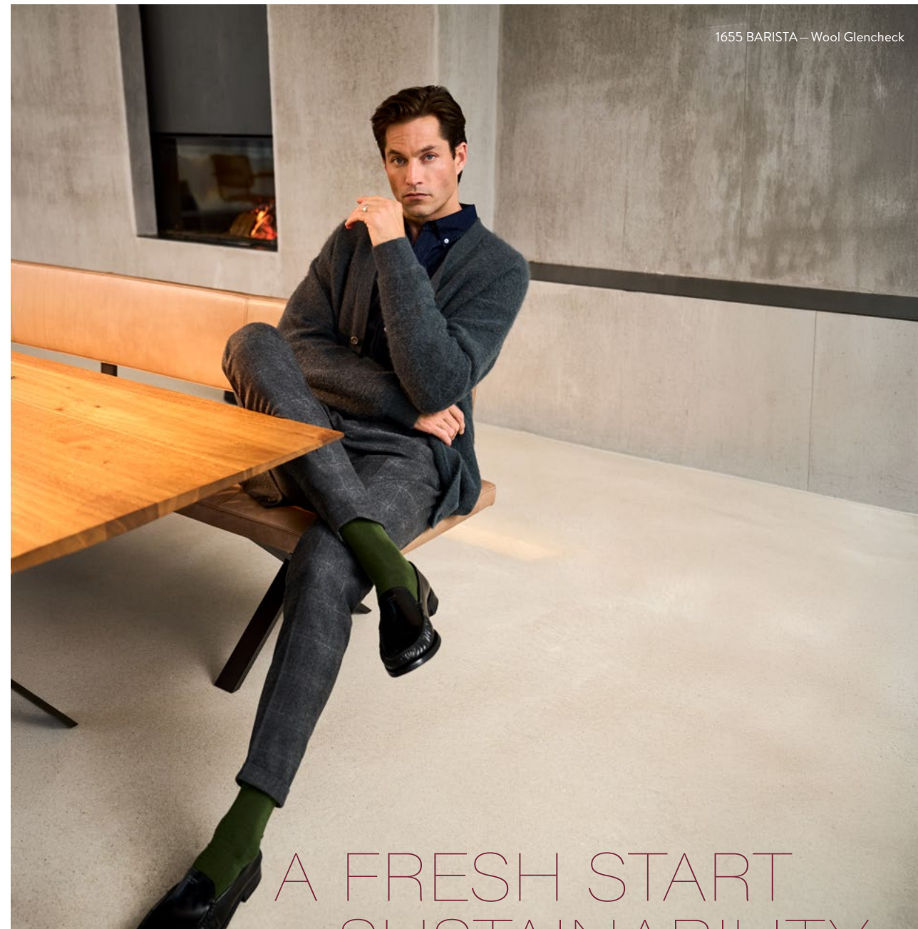
1655 BARISTA – Wool Glencheck