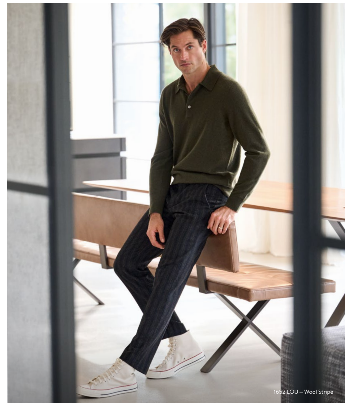
1652 LOU – Wool Stripe

The transition from the old year to the new is traditionally a time to pause, reflect, and take a bold look ahead to the future. Questions about continuity and change come to the fore: what will move on, what will stay the same? ALBERTO and its production partners have spent years exploring this very question, driving the consistent, forward-thinking development of a fashion culture defined by sustainability and quality without sacrificing an iota of style. This approach once again played a defining role in the design of the autumn/winter 2026 pants collection.