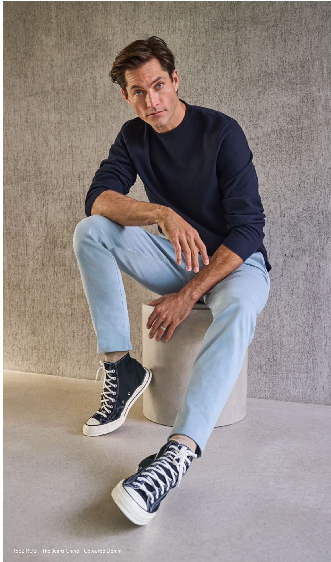
1582 ROB — The Jeans Chino - Coloured Denim

An unbeatable autumn/winter alternative to the classic 5-pocket: the “ Garment Dye Jeans Chino ”. This fashionable style icon owes its stretch to the specially developed DualFX® fibres, a unique blend of T400® and elastane. The sporty back label, the luxurious buttons made of real corozo, and the intricately designed pocket lining all contribute to this fantastic look.