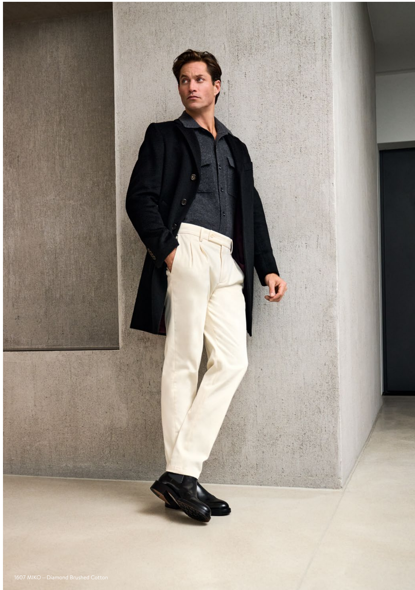
1607 MIKO — Diamond Brushed Cotton