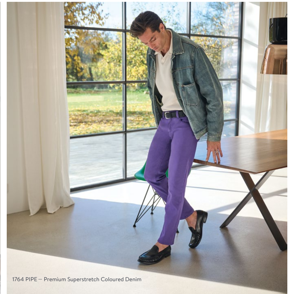
1764 PIPE — Premium Superstretch Coloured Denim