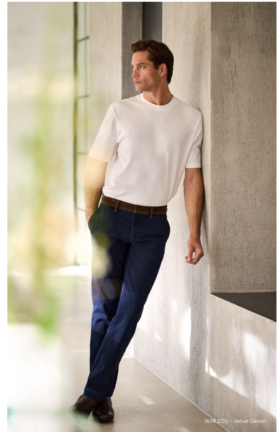
1698 LOU – Velvet Denim