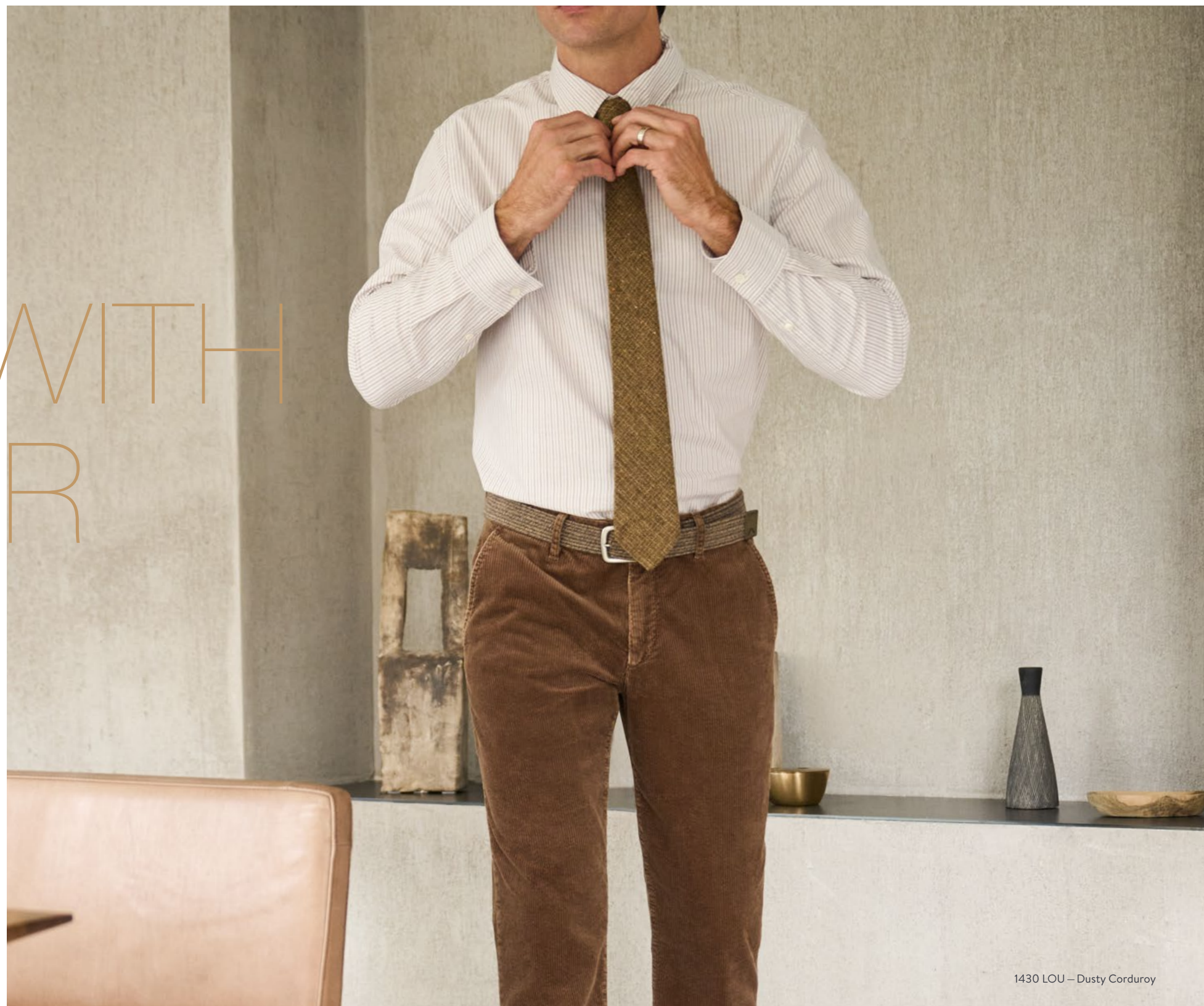
1430 LOU — Dusty Corduroy

Whether a walk through the park, an espresso at your favourite café, or a short excursion into the countryside: if you don't want to compromise on comfort or style during the colder months, you need to choose your pants wisely. This is where comfort, warmth, and freedom of movement are paramount. ALBERTO delivers true all-rounders: smartly designed, functional and comfortable pants that rise to every occasion and look darn good doing it.