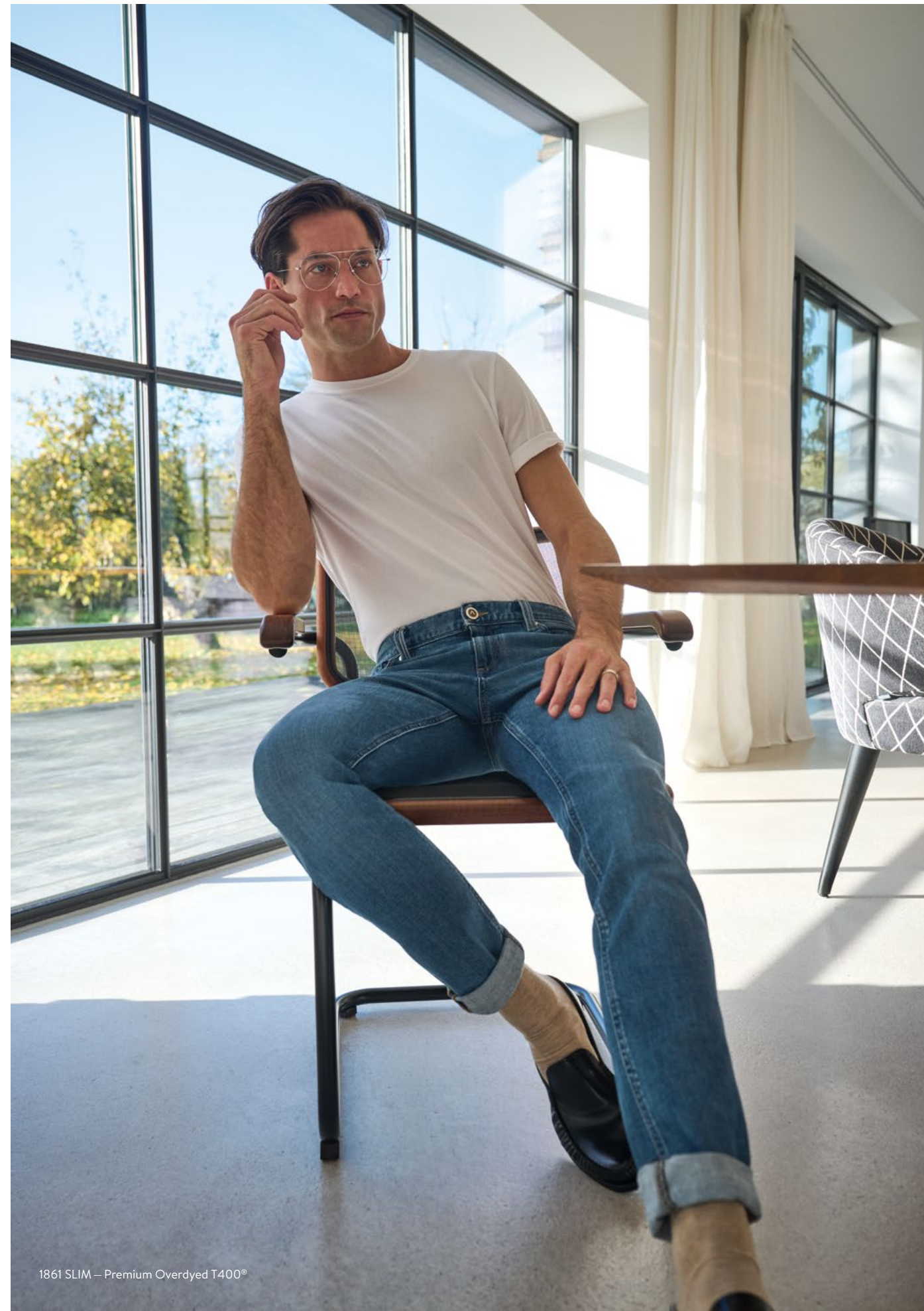
1861 SLIM — Premium Overdyed T400®