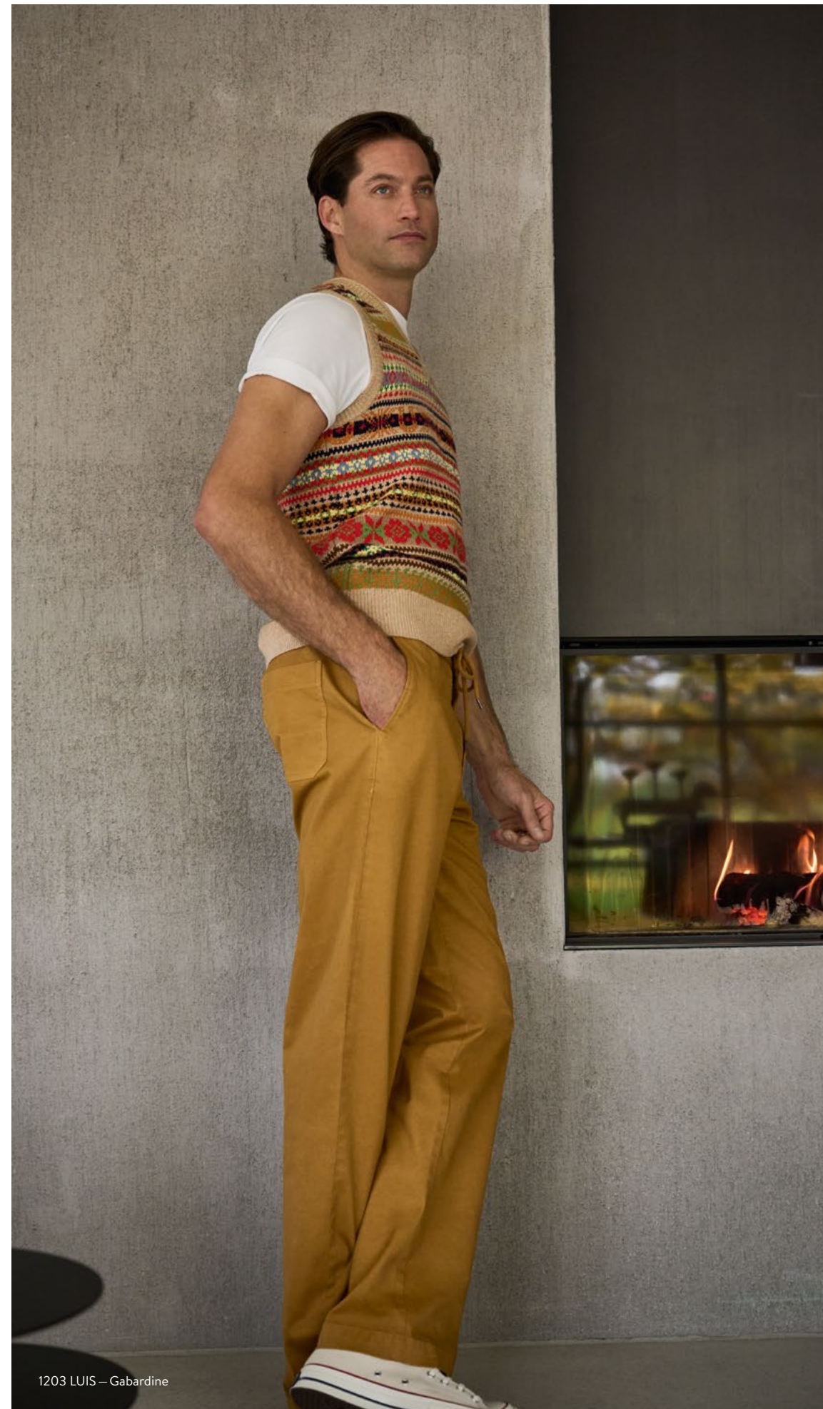
1203 LUIS — Gabardine

Outside the office, ALBERTO offers a fresh take on the urban autumn/winter look with the pieces in its Work & Wear line. Right on time for the end of summer, the Mönchengladbach-based pants tailors present three chinos in brilliant colours. Along with the LUIS “Gabardine” — a classically refined wide-fit, straight-leg slack — and the brand-new BUCK “Soft Terra Twill”, crafted from an ultra-soft, highly elastic blend of organic cotton and Tencel™ twill, the BUCK “Pima Cotton” emerges as one of the season’s essentials. Made from exceptionally soft Pima cotton and finished with a utility pocket at the side, this one-of-a-kind piece is the perfect choice for authentic style and effortless ease — especially when paired with a sweater. These pants follow your movement, not the other way around: they are flexible, uncompromisingly modern, and keep their shape. Premium materials meet tailoring, function meets form. ALBERTO calls this “urban intelligence”.