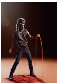
MOTIF 23 Article: 8209 ANDY, Fade Out Cord Material: 98% cotton, 2% spandex Sizes: inch Colours: beige, brown, dark brown, rust red Delivery period: July - September 2012