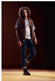
MOTIF 8 Article: 8201 ANDY, Cotton Gabardine Material: 100% cotton Sizes: inch Colours: brown, dark brown, beige, navy, military Delivery period: July - September 2012