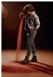
MOTIF 10 Article: 8203 ANDY, Pima Cotton Material: 96% cotton, 4% spandex Sizes: inch Colours: light olive, beige, grey, dark green Delivery period: July - September 2012