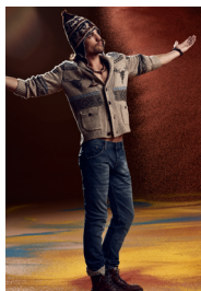
MOTIF 22 Article: 8261 ASH, Coloured Denim Material: 100% cotton Sizes: inch Colours: blue, denim, navy, black, grey melange Delivery period: July - September 2012