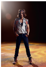
MOTIF 19 Article: 8236 ASH, Red Selvedge Material: 100% cotton Sizes: inch Colours: navy, denim, dark denim Delivery period: July - September 2012