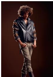
MOTIF 7 Article: 8201 ALAN, Cotton Gabardine Material: 100% cotton Sizes: inch Colours: brown, dark brown, beige, navy, military Delivery period: July - September 2012