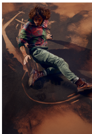
MOTIF 9 Article: 8201 AUSTIN, Cotton Gabardine Material: 100% cotton Sizes: inch Colours: brown, dark brown, beige, navy, military Delivery period: July - September 2012