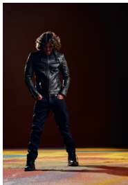
MOTIF 31 Article: 8238 ALEX, Selvedge Material: 100% cotton Sizes: inch Colours: blue, royalblue Delivery period: July - September 2012