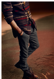
MOTIF 12 Article: 8212 ANDY, Washed Tweed Material: 60% wool, 39% polyester, 1% spandex Sizes: inch Colours: light grey melange Delivery period: July - September 2012