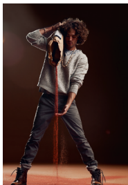
MOTIF 11 Article: 8203 ANDY, Pima Cotton Material: 96% cotton, 4% spandex Sizes: inch Colours: light olive, beige, grey, dark green Delivery period: July - September 2012