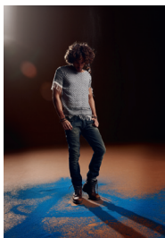
MOTIF 21 Article: 8261 ADAM, Coloured Denim Material: 100% cotton Sizes: inch Colours: blue, denim, navy, black, grey melange Delivery period: July - September 2012