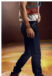
MOTIF 20 Article: 8236 ASH, Red Selvedge Material: 100% cotton Sizes: inch Colours: navy, denim, dark denim Delivery period: July - September 2012