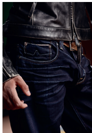
MOTIF 32 Article: 8238 ALEX, Selvedge Material: 100% cotton Sizes: inch Colours: blue, royalblue Delivery period: July - September 2012